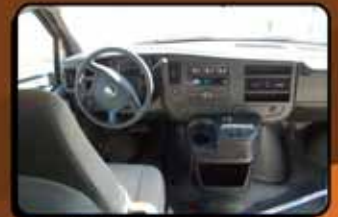
Driver's Area - Sample