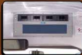
Front Bulkhead Air Conditioning w/ Skirt-mounted Condenser