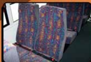
High Back Activity Seats