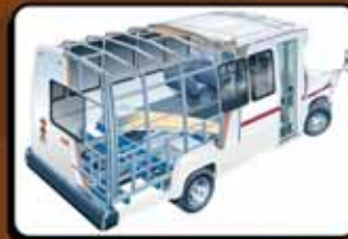
Steel Cage Construction