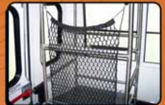
Rear Storage Area