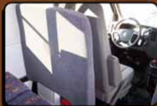
Driver's Side Modesty Panel