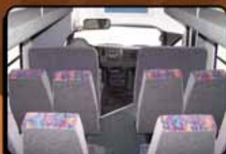
Back to Front