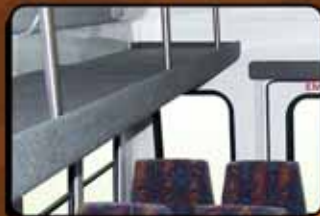
Overhead Parcel Bins